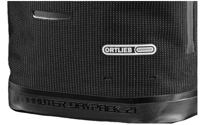
Name and size specification