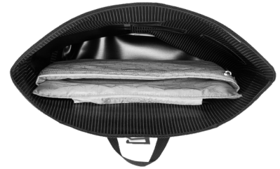
Dimensions laptop sleeve: (39 cm x 27 cm x 2,5 cm / 15.4 in. x 10.6 in. x 1.0 in.)