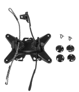
Optional application with Bar-Lock mounting set possible (not included in the scope of delivery)