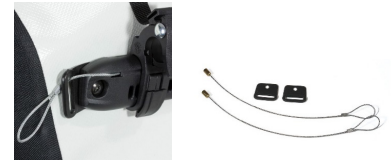
Illustration in closed state

Compatible with E124/E125 as an optional, additional spare part