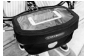
Smartphone in transparent lid compartment (not included)