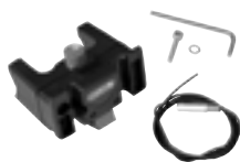
E225 Handlebar Mounting-Set