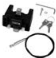
E185 Handlebar Mounting-Set with Lock