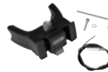
E226 Handlebar Mounting-Set E-Bike