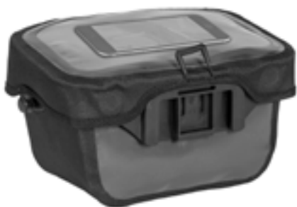
Smartphone in transparent lid compartment (not included)