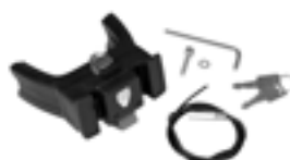
E207 Handlebar Mounting-Set E-Bike with Lock