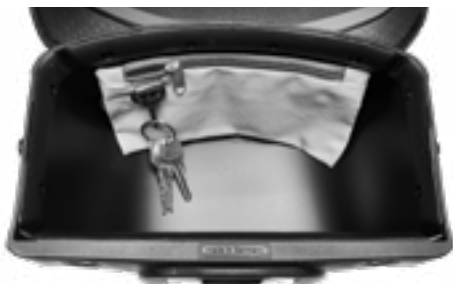
Carabiner with key chain

Handlebar mounting-set (sold separately):