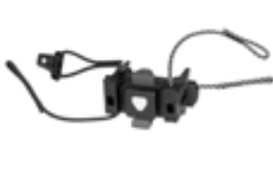
E241 Handlebar Mounting-Set QR

Handlebar mounting-set (sold separately):