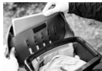
Opening lid compartment: 20,5cm / 8.1in.