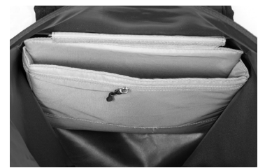
Inner pocket for laptops